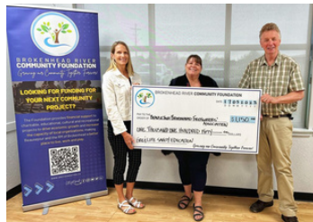
Beausejour Brokenhead Firefighter's Association $1,150.00