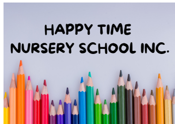
Happy Time Nursery School Inc. $258.00