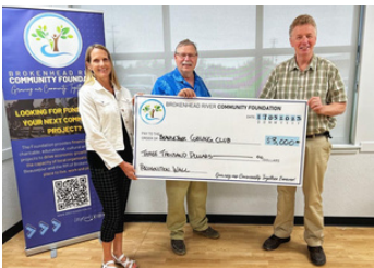
Beausejour Curling Club $3,000.00